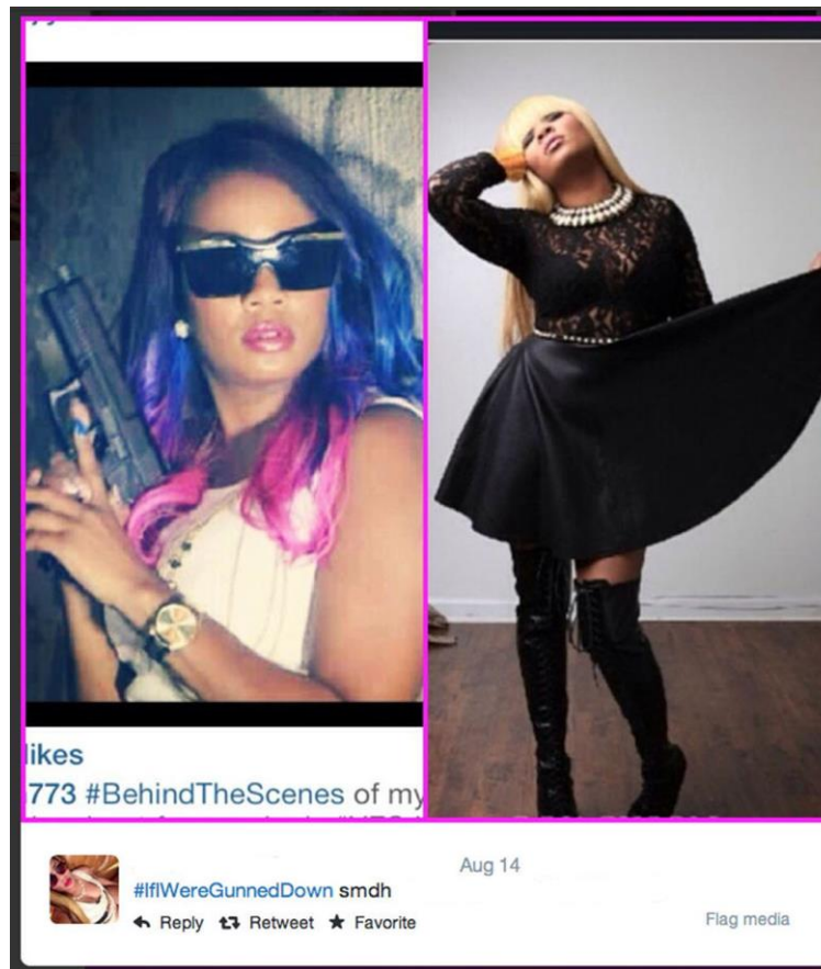
Figure 3. Typical Twitter dual image in the contention for space.

Further evidence that the typical protest tweets were part of a visual, rhetorical battle for space in the public sphere could be found in non-typical postings that did not fit news conventions. This suggests that while a few taking part in the protest were focusing on the underlying message of how young African-American males were being treated by law enforcement, the clear majority were engaging in essentially a media critique, arguing that different messages should be displayed in the same space provided by the traditional media. For instance, Figure 4 displays a text-based meme rather than images of human bodies or faces. If the Twitter protest were not one based in the idea of contending for space within media portrayals, many more variations would be expected associated with the hashtag.