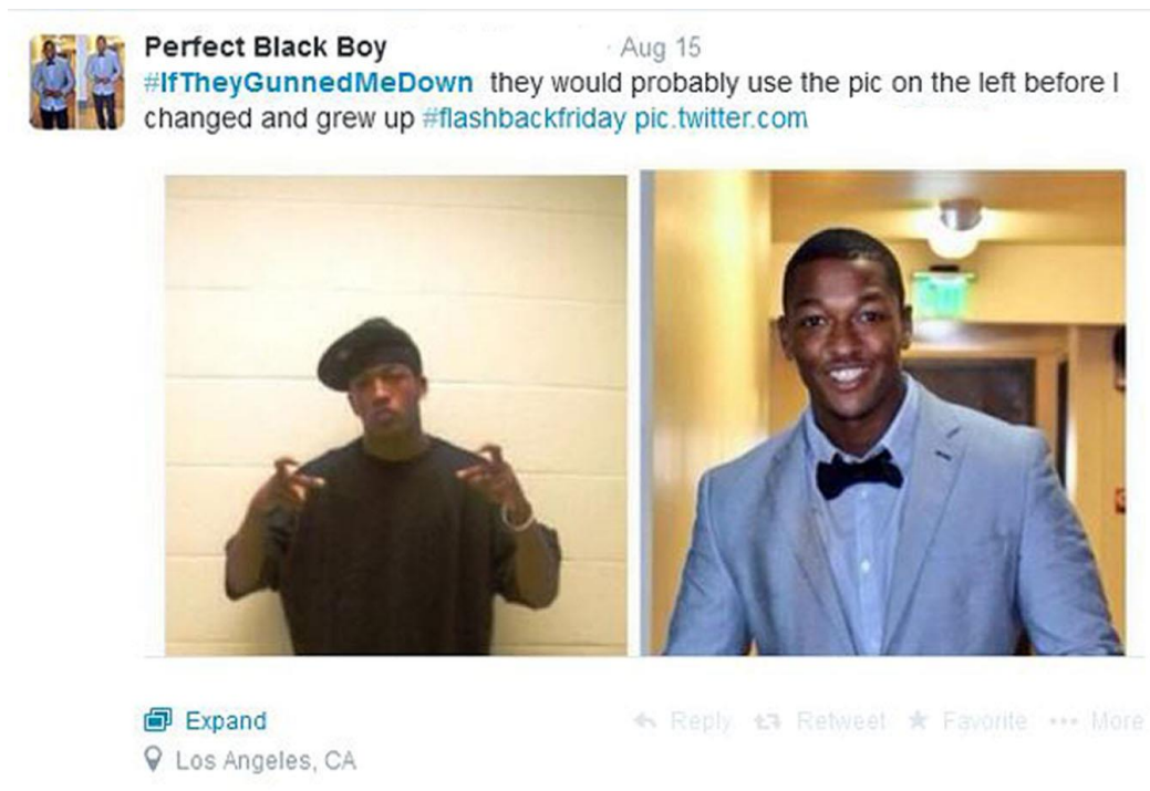
Figure 5. Using image to suggest differing meanings.

Overall, the two images represent two entirely different meanings. The left suggests a young African-American male in an institutional situation, his dress and manner suggestive of defying authority. The right image offers, in many ways, opposite meanings, with the dress, environment, and facial expressions suggestive of rather than defying authority, being the authority.