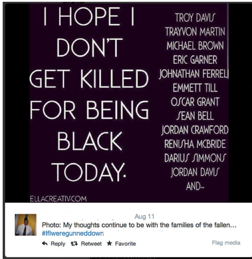
Figure 4. A typical meme associated with the hashtag.

Schein (1999) argues a “cultural landscape can be racialized, and a racialized landscape serve to either naturalize, or make normal, or provide the means to challenge racial formations and racist practices” (p. 189). The images and memes on Twitter play to this idea of a fight for control over how the posters are viewed.