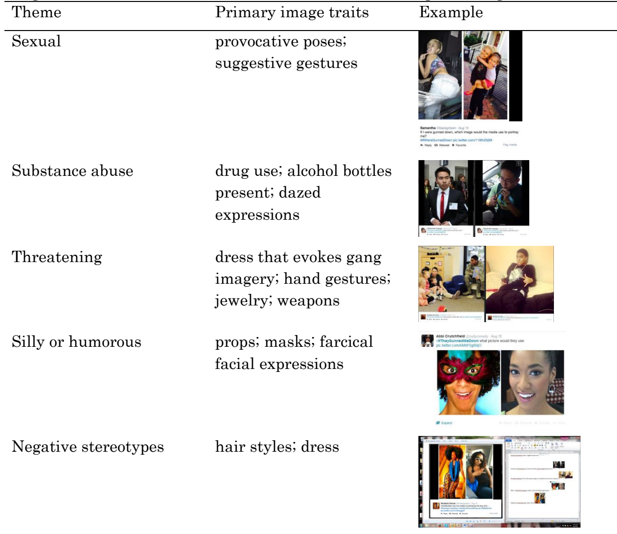
Table 1 Negative Themes and Traits Associated with the Hashtag #ifiweregunneddown

In regards to RQ2, what evidence could be found for the contention of space in the media, this study found a variety of indications that the posts were designed (as was the protest) to challenge imagery occupying space, or geography, as offered by the traditional media.