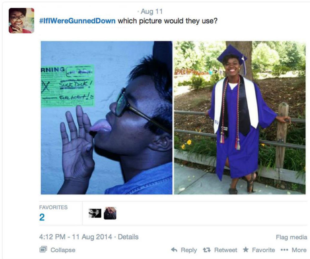
Figure 1. Typical posting associated with the hashtag #ifiweregunneddown.

suggestive image is darker and tinted blue. The tone and lighting in both photographs enhance the positivity and negativity of each image.